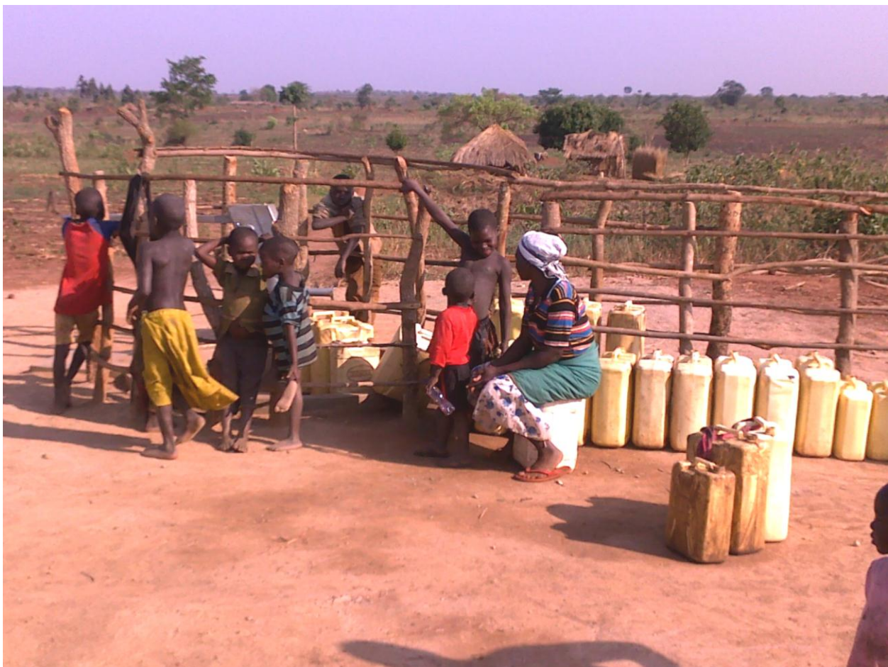
Figure 3: Isunga borehole – a new facility constructed in FY 2016/2017