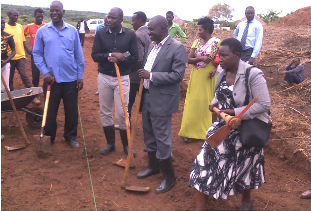
Figure 2: District Leaders at the Launch of NUSAF Community Labour-Based Road at Kinyonga Village (May 2017).