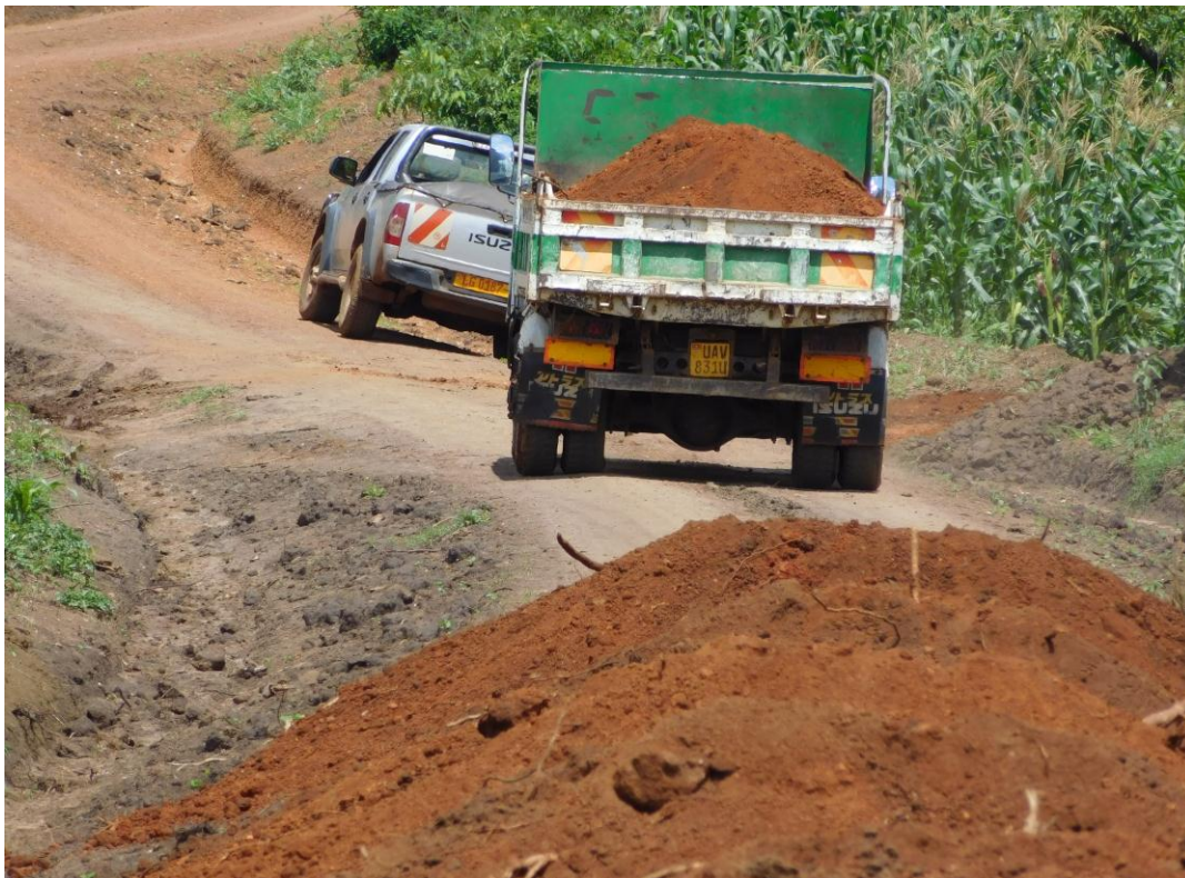
Figure 1: Works during construction of Naguru-Gaspa Road (DDEG-funded).

(d) Under NUSAF Community Labour-Based System, 1.6km was constructed connecting Kinyonga village to Kaduku II in Masindi Port Sub County.